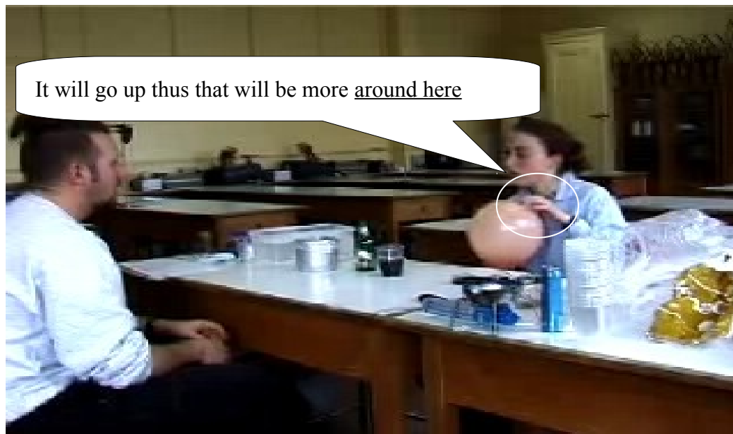
Figure 4: Student E express through talk, deictic gesture and the salient element (balloon full of helium) the idea glossed as "helium act more into the top of a balloon full of helium"

Student says: "It will go up thus that will be more around here" (talk) while pointing (deictic gesture) with her hand in the direction of the top of the balloon (salient element in the setting). To understand the meaning, we need to simultaneously analyze the three modalities (talk, gestures, salient element in the setting), which can mean that helium act more into the top of the balloon and it could be the explanation of the fact that the balloon full of helium goes up. The physic point of view considers that helium acts everywhere into the balloon, and we need to compare the density of air and helium to understand why the balloon full of helium goes up.