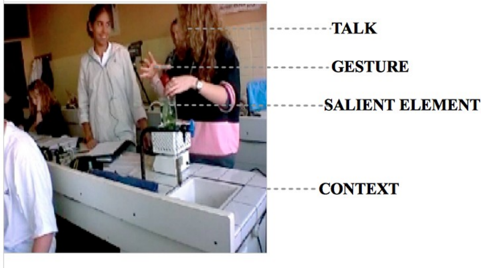
Figure 2: Idea express the meaning through semiotic resources (talk, gesture, salient element, context)

Our study focuses on the actions which support student's communication. We define an " idea " as the meaning expressed by a person through semiotic resources contained in language in a specific context, and reconstructed by the researcher (figure 2).