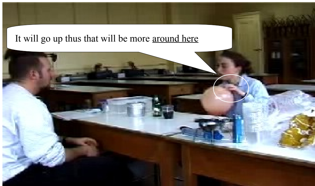
Figure 4: Student E express through talk, deictic gesture and the salient element (balloon full of helium) the idea glossed as "helium act more into the top of a balloon full of helium"

Student says: "It will go up thus that will be more around here" (talk) while pointing (deictic gesture) with her hand in the direction of the top of the balloon (salient element in the setting). To understand the meaning, we need to simultaneously analyze the three modalities (talk, gestures, salient element in the setting), which can mean that helium act more into the top of the balloon and it could be the explanation of the fact that the balloon full of helium goes up. The physic point of view considers that helium acts everywhere into the balloon, and we need to compare the density of air and helium to understand why the balloon full of helium goes up.