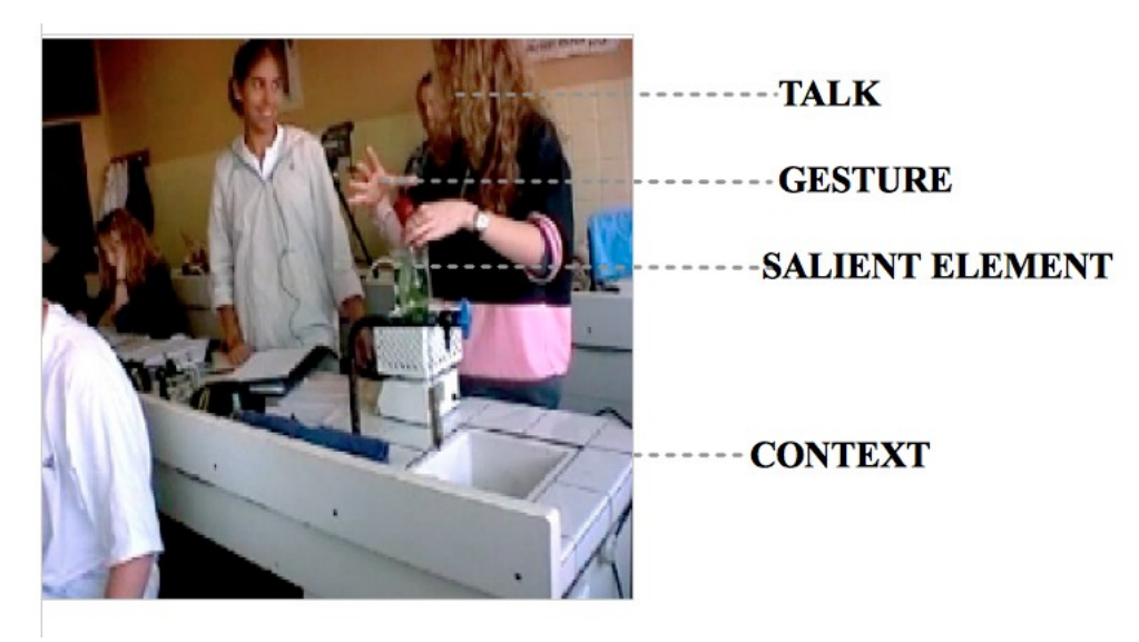
Figure 2: Idea express the meaning through semiotic resources (talk, gesture, salient element, context)

Our study focuses on the actions which support student's communication. We define an " idea " as the meaning expressed by a person through semiotic resources contained in language in a specific context, and reconstructed by the researcher (figure 2).