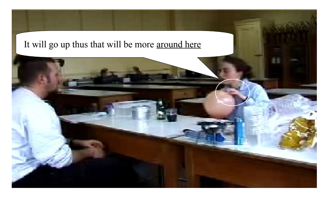
Figure 4: Student E express through talk, deictic gesture and the salient element (balloon full of helium) the idea glossed as "helium act more into the top of a balloon full of helium"

Student says: "It will go up thus that will be more around here" (talk) while pointing (deictic gesture) with her hand in the direction of the top of the balloon (salient element in the setting). To understand the meaning, we need to simultaneously analyze the three modalities (talk, gestures, salient element in the setting), which can mean that helium act more into the top of the balloon and it could be the explanation of the fact that the balloon full of helium goes up. The physic point of view considers that helium acts everywhere into the balloon, and we need to compare the density of air and helium to understand why the balloon full of helium goes up.