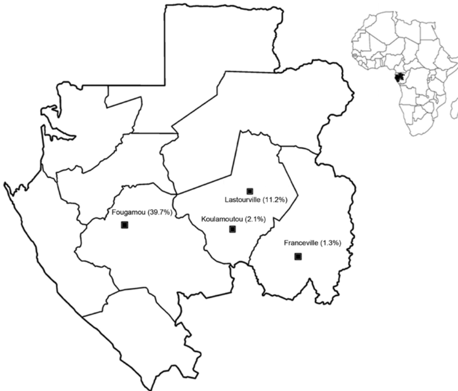
Figure 1. Four rural (Fougamou and Lastourville), semiurban (Koulamoutou), and urban (Franceville) locations in Gabon where children <15 years of age were tested for Rickettsia felis infection, April 2013–January 2014. Percentages in parentheses indicate the prevalence of R. felis infection among febrile children. Inset shows location of Gabon on the Atlantic Coast of Africa.

Center of Lastourville, are in semiurban and rural areas, respectively, of Ogooué Lolo Province. The fourth center, the Medical Research Unit of Ngounie in Fougamou, is in a rural area of Ngounié Province.