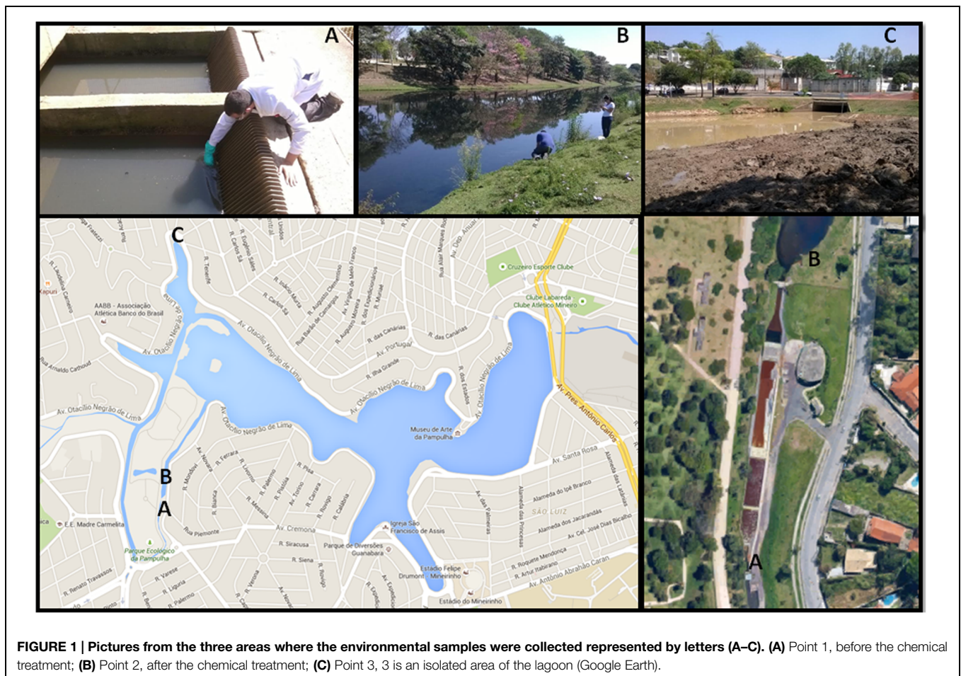
FIGURE 1 | Pictures from the three areas where the environmental samples were collected represented by letters (A–C). (A) Point 1, before the chemical treatment; (B) Point 2, after the chemical treatment; (C) Point 3, 3 is an isolated area of the lagoon (Google Earth).

Initially, the samples were divided in two groups, one with sediment-free water and the other with a high concentration of