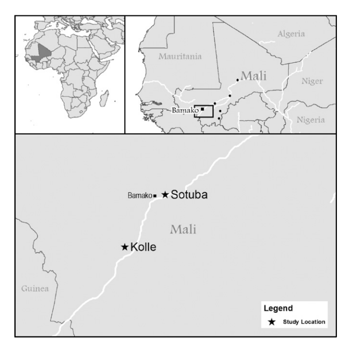
FIGURE 1. Map of Africa, Mali with capital Bamako, and study sites Sotuba and Kollé.

Sotuba and 176 mm in Kollé, during the subsequent dry season hardly any rain fell with on average 5 mm and 3 mm, respectively.