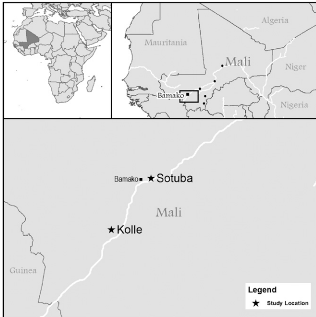
FIGURE 1. Map of Africa, Mali with capital Bamako, and study sites Sotuba and Kollé.

Sotuba and 176 mm in Kollé, during the subsequent dry season hardly any rain fell with on average 5 mm and 3 mm, respectively.