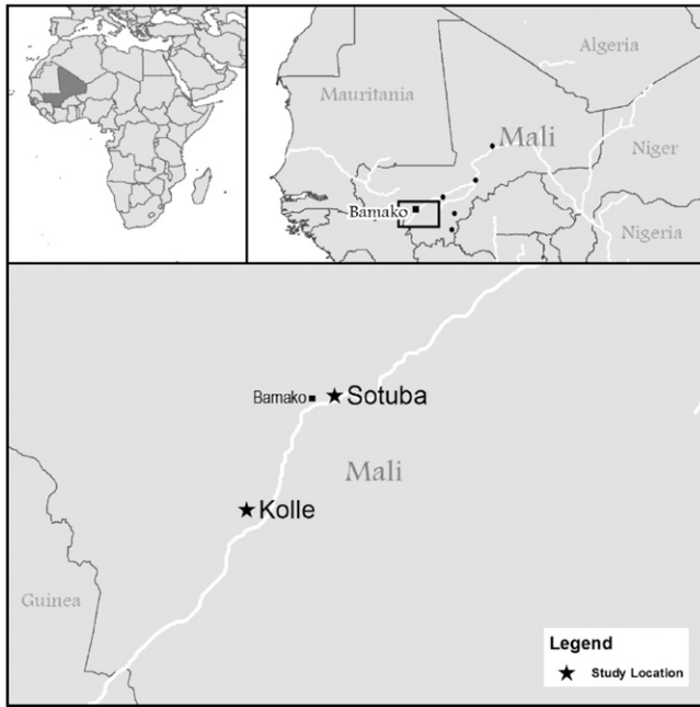
FIGURE 1. Map of Africa, Mali with capital Bamako, and study sites Sotuba and Kollé.

Sotuba and 176 mm in Kollé, during the subsequent dry season hardly any rain fell with on average 5 mm and 3 mm, respectively.