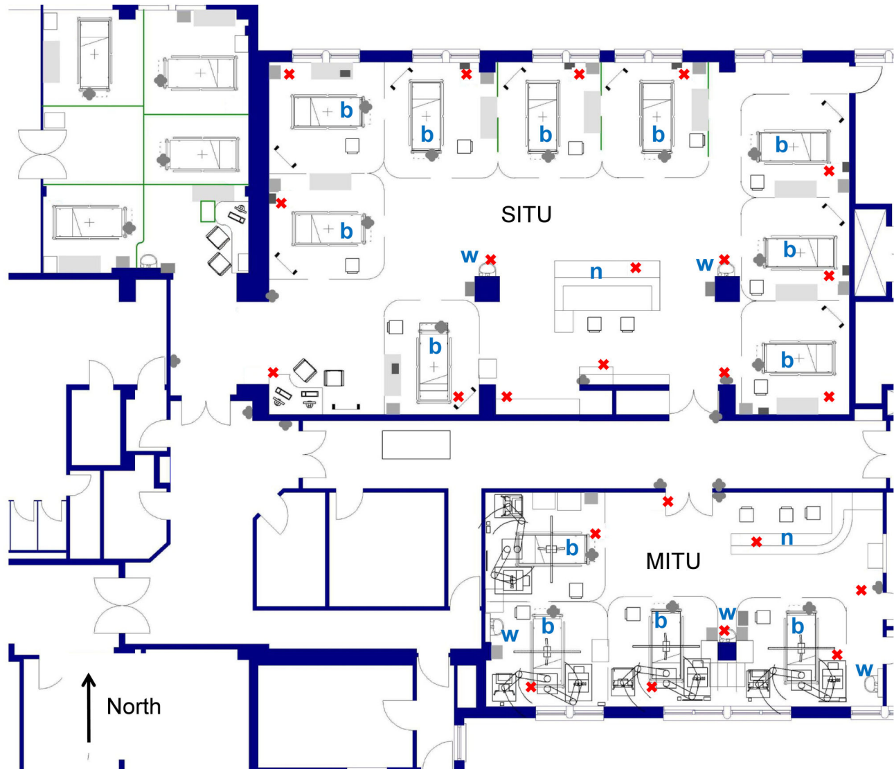
Figure 1. Map of the studied units. The red crosses represent the sampling locations. MITU: medical intensive care unit; SITU: surgical intensive care unit; b: bed; w: clinical waste bin; n: nurse's station.