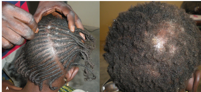
Fig 2. Tinea capitis clinical presentation. (A) Trichophytic presentation with diffuse relatively small scalp lesions, mainly involving Trichophyton soudanense . (B) Microsporic presentation with relatively large and scarce lesions, mainly involving Microsporum audouinii .