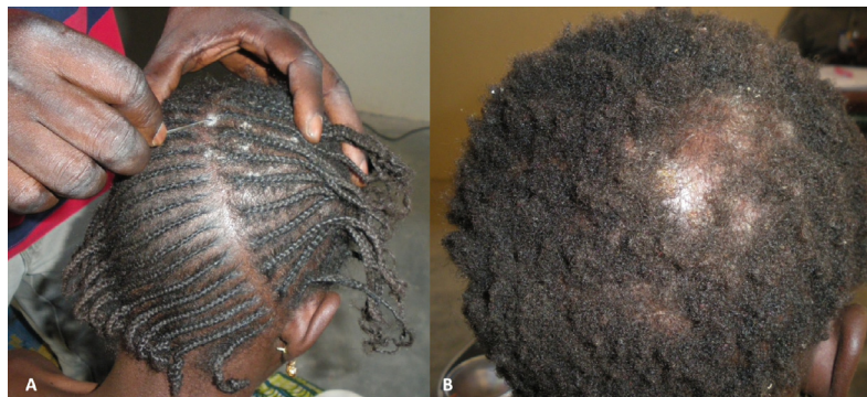
Fig 2. Tinea capitis clinical presentation. (A) Trichophytic presentation with diffuse relatively small scalp lesions, mainly involving Trichophyton soudanense . (B) Microsporic presentation with relatively large and scarce lesions, mainly involving Microsporum audouinii .