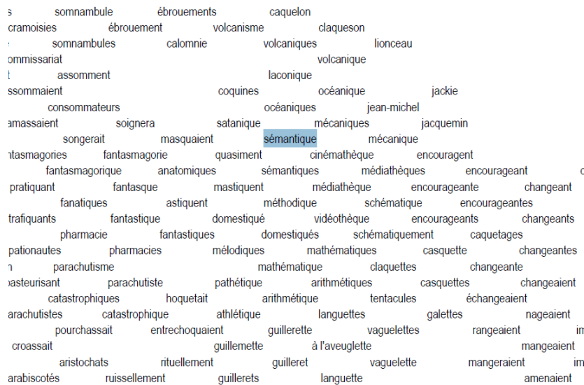
Fig. 8. Enhancement of the (fig. 7) cortical map. The neighborhood size is 6, e.g., the word “sémantique” has 6 neighbors: “satannique, océaniques, mécaniques, cinémathèque, sémantiques, quasiment”.

Using this ultra-fast learning map, we build a bigram representation of the 50 000 words (Fig. 7 & 8). Note that we also changed the number of neighbors, from 4 to 6 (hexagonal lattice), following the original formulation of the SOM [20]. This allows for a more compact map, with less frontiers and discontinuities. Also the hexagonal lattice appears to be more biologically plausible, and more efficient. Our ultra-fast SOM shares a number of similarities with the SOM of symbol strings [25], a much earlier work. However, among other differences, where the SOM of symbol strings involves successive training and growing phases, our proposal integrates learning and growing in one step.