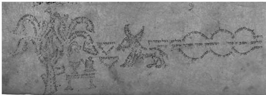
Figure 6: MS Vatican, BAV, Vat. Ebr. 14, f. 17r (bottom of the folio).

The biblical passage in fol. 17r goes from Gen. 17:23 to 18:8 (i.e., the beginning of Parasha Vayyera in Gen. 18:1).