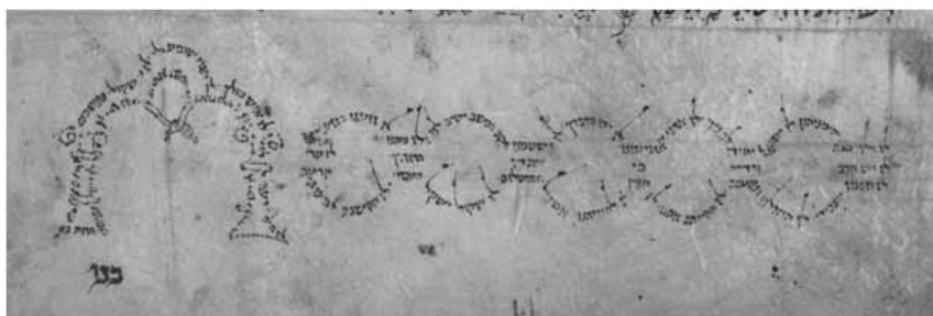
Figure 4: MS Vatican, BAV, Vat. Ebr. 14, f. 16v (bottom of the folio).

The biblical passage in fol. 16v is from Gen.17:10 to 17:23 (end of Parasha Lekh lekha ).