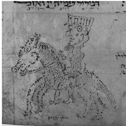
Figure 5: MS Vatican, BAV, Vat. Ebr. 14, f. 12r (bottom of the folio).

The biblical passage in fol. 12r is from Gen. 11:23 to 12:4 (i.e., the beginning of Parasha Lekh lekha in Gen 12:1).