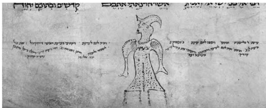
Figure 7: MS Vatican, BAV, Vat. Ebr. 14, f.166r (bottom of the folio).

The biblical text is from Num. 15:33 to 16:3, end of Parasha Shelah .