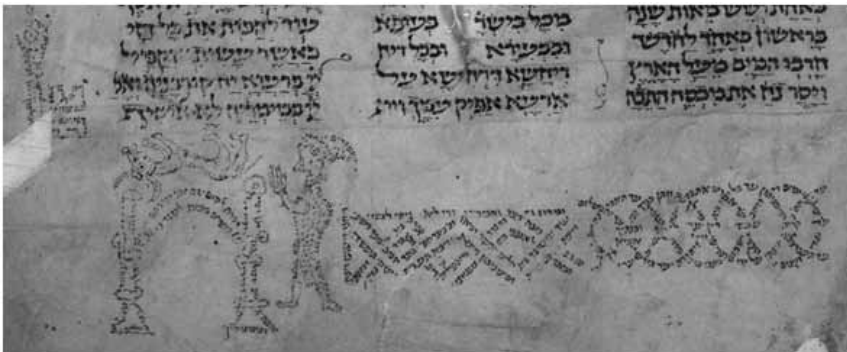
Figure 3: MS Vatican, BAV, Vat. Ebr. 14, f. 9r (bottom of the folio).

The biblical text on fol. 9r displays the verses running from Gen. 8:10 to 8:21.