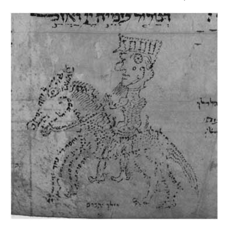
Figure 5: MS Vatican, BAV, Vat. Ebr. 14, f. 12r (bottom of the folio).

The biblical passage in fol. 12r is from Gen. 11:23 to 12:4 (i.e., the beginning of Parasha Lekh lekha in Gen 12:1).