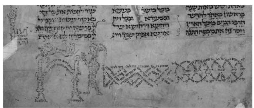
Figure 3: MS Vatican, BAV, Vat. Ebr. 14, f. 9r (bottom of the folio).

The biblical text on fol. 9r displays the verses running from Gen. 8:10 to 8:21.