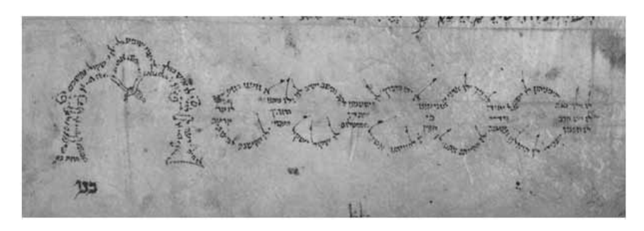
Figure 4: MS Vatican, BAV, Vat. Ebr. 14, f. 16v (bottom of the folio).

The biblical passage in fol. 16v is from Gen.17:10 to 17:23 (end of Parasha Lekh lekha ).