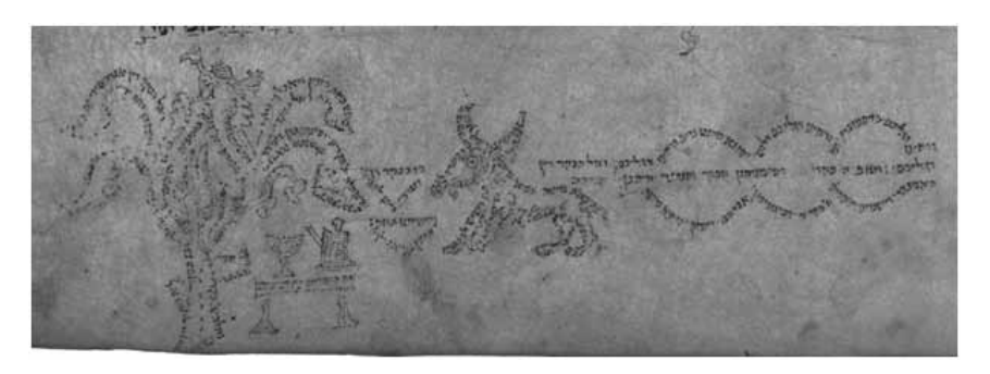
Figure 6: MS Vatican, BAV, Vat. Ebr. 14, f. 17r (bottom of the folio).

The biblical passage in fol. 17r goes from Gen. 17:23 to 18:8 (i.e., the beginning of Parasha Vayyera in Gen. 18:1).