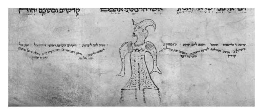
Figure 7: MS Vatican, BAV, Vat. Ebr. 14, f.166r (bottom of the folio).

The biblical text is from Num. 15:33 to 16:3, end of Parasha Shelah.