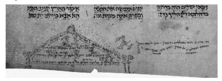
Figure 2: MS Vatican, BAV, Vat. Ebr. 14, f. 7r (bottom of the folio).

The biblical text in the folio 7r continues from Gen. 6:6 to 6:17 (beginning of Parasha Noah 6:9).