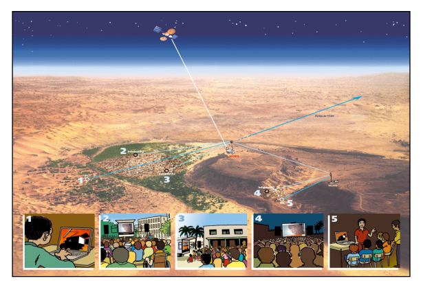
Figure 3: The "on-the-road communication" and 5th screen technical concept

This information emergency transmission for developing countries is on the way to be implemented by European Organisations, NGOs and United Nations Organisations through the use of the 5^{th} screen (Skacan<sup>1</sup>). In fact, the such called 5^{th} screen gathers broadcasting on a wide screen through satellite access as well as mobile computing abilities. The use of a 4x4 lorry reaches geographically and socially isolated populations. All the messages can be broadcasted in vernacular language by using an instantaneous dubbing system. The Nomadic Dream Machines Team can train technicians all over the world to use the 5th screen 4x4 lorry and maintain the High Technical system updated and working.