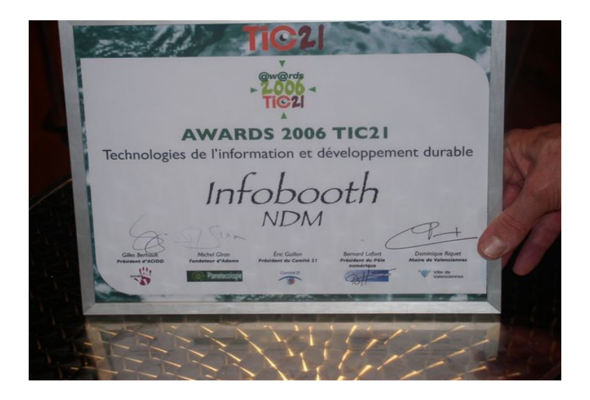
Figure 4: Troughout the event, the proof of experimentation and the process of convincing, an added value is created