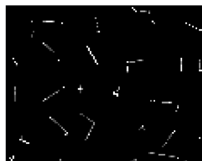
Figure 4: Panel of images obtained with the developed simulation code.