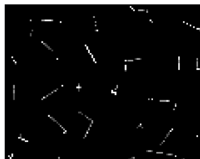
Figure 4: Panel of images obtained with the developed simulation code.