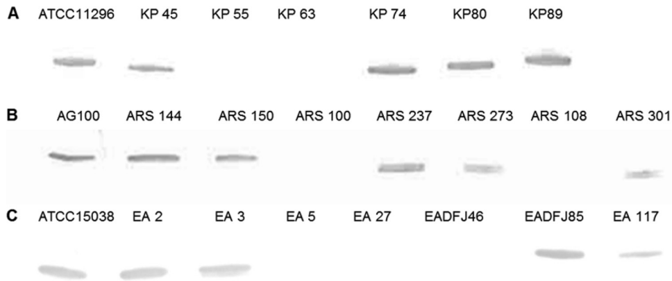
FIG 1 Immunodetection by Western blotting of porins in various bacterial strains grown in MHII broth. Detection was carried out with a mix of anti-OmpF antiserum and anti-OmpC antiserum. (A) K. pneumoniae strains; (B) E. coli strains; (C) E. aerogenes strains. Only the relevant part of the gel is shown.