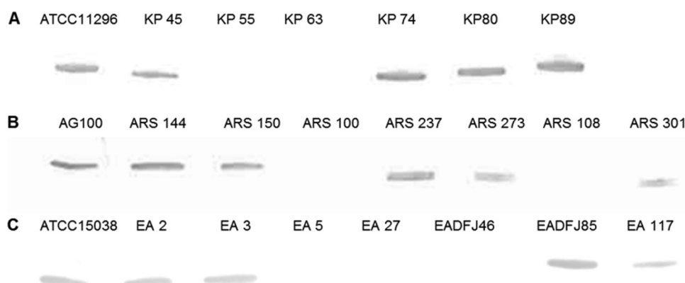
FIG 1 Immunodetection by Western blotting of porins in various bacterial strains grown in MHII broth. Detection was carried out with a mix of anti-OmpF antiserum and anti-OmpC antiserum. (A) K. pneumoniae strains; (B) E. coli strains; (C) E. aerogenes strains. Only the relevant part of the gel is shown.