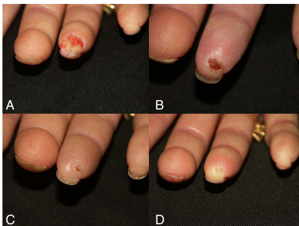
Figure 3 Example of digital ulcer evolution during the clinical trial in a patient who was assigned to the sildenafil group. (A) at randomisation; (B) at week 4; (C) at week 8; and (D) at week 12.