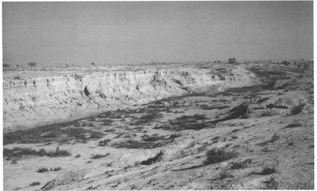
Figure 7.5 Holocene terraces in the Wadi el Akarit (Tunisia). A very low terrace of post-Islamic date (610 \pm 110 BP) is fitted into a gypseous terrace of late pre-historic date