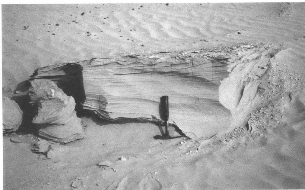
Figure 7.2 Flood deposits at Ksar Rhilane (Tunisia): bedded silts and sands (dated to 2380 \pm 155 BP) with ripple-marks in the upper part, with the present-day dunes behind