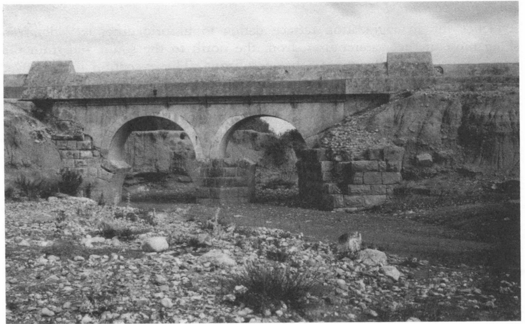
Figure 7.3 The modern aqueduct crossing Wadi Bou Jbib, Carthage, built on the piles of the Hadrianic aqueduct

Note: The right-hand pile is partly covered by grey silts belonging to the historic-period Holocene terrace