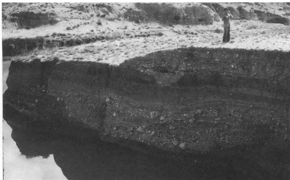
Figure 7.4 Holocene terrace of Wadi Chéria-Mezeraa (Algeria)

Note: The stratigraphy visible to the left of the standing figure is, from bottom to top: grey silts; bedded pebbles (Early Holocene); beige-grey silts (dated to 1370 \pm 70 BP); and a Roman drainage ditch filled with pebbles