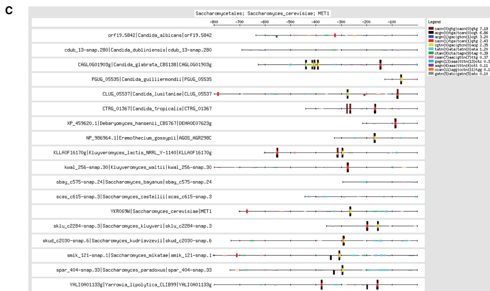
Figure 2. Example of result from footprint-discovery . (A) overrepresented dyads detected in promoters of orthologs of the yeast gene MET1 . (B) PSSM obtained by assembling the most significant dyads and using them as seeds to scan the input sequences. (C) Feature map of the significant dyads. The clumps of overlapping boxes are indicative of good predictions for binding sites.

fail to reflect the behavior of the same program on real biological sequences. Indeed, some biological sequences are too complex to be modeled by a simple Markov chain. A more realistic control can be achieved with random-genes .