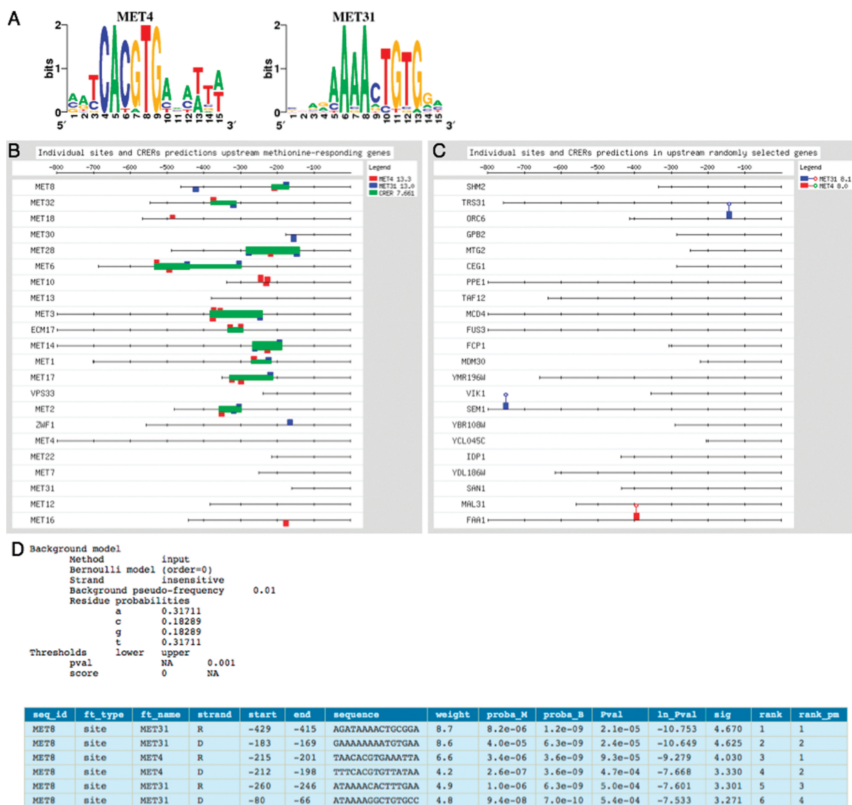
Figure 3. Example of matrix-scan result obtained by scanning yeast upstream sequences with matrices representing binding motifs for the transcription factors Met4p and Met31p. (A) Sequence logos representing binding motifs of the Met4p and Met31p transcription factors. (B) Feature map of the predicted sites and CRERs in upstream sequences of 26 yeast genes involved in methionine metabolism. (C) Random control: feature map of the predicted sites and CRERs detected in upstream sequences of 26 yeast genes selected at random. (D) Fragment of a matrix-scan result table reporting putative sites.

significant results with coexpressed genes, and no result with randomly selected genes.