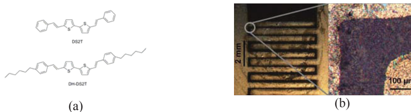
Figure 1: (a) Molecular structures of distyryl-bithiophene (DS2T) and \alpha , \omega -hexyl-distyryl-bithiophene (DH-DS2T). (b) Optical microscopy images of DH-DS2T based thin films deposited by drop-casting on Si/SiO 2 substrates.

Several series of simple structurally and readily available oligothiophene derivatives end-capped with styryl units, \text{DS}_n\text{T} s ( n = 2-4 ) were synthesised. Due to their low solubility in common organic solvents, we applied substitution of hexyl chains on \alpha - \omega -end positions of DS2T (Figure 1a) as simple approach to increase their solubility ( \alpha - \omega -hexyl-distyrylbithiophene: DH-DS2T) [11]. Thus, DH-DS2T oligomers can be processed from liquid solution at room temperature. In order to realize fully solution-processed gas sensor, DH-DS2T films were realized by solution drop casting on a polymer flexible substrate bearing printing metal electrodes. Polyethylene terephthalate (PET) sheets were used as flexible substrate. We use a solution containing DH-DS2T in chlorobenzene at 1,5 \times 10^{-3} mol/l. Finally, DH-DS2T was drop casted on a PET substrate where metallic ink, purchased from CABOT was prior printed by inkjet printing methods to performed Silver (Ag) interdigitated electrode arrays (Figure 1b). Then, gas sensing experiments were performed by measuring the sensor electrical resistance upon exposing to four controlled gas concentrations (ammonia \text{NH}_3 , ozone \text{O}_3 , nitrogen dioxide \text{NO}_2 , carbon monoxide \text{CO} ). At room temperature, sensors were exposed to the desired ammonia concentrations which are obtained by mixing a standard gas known volume with dry air.