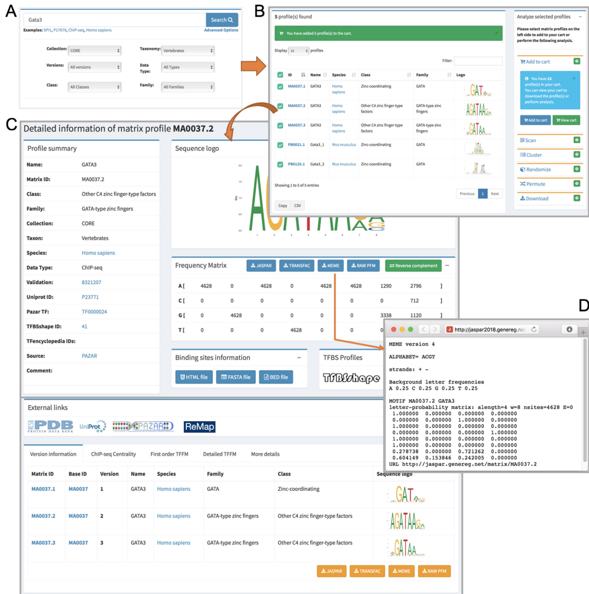
Figure 2. Overview of the JASPAR 2018 new web interface with interactive searching activity. (A) A quick and detailed search feature on the homepage. (B) A responsive table lists the searched profile(s), which can be further selected and added to the cart listed on the right panel for users to perform their own analyses. (C) A detailed page for the GATA3 matrix profile, which is divided into sub-panels including the profile summary, sequence logo, PFM, TF-binding information, external links, version information, ChIP-seq centrality, TFFM and other details. (D) The PFM for the GATA3 profile (MA0037.2) is downloaded in MEME format using the RESTful API.

well as in each TF class per taxon. The clustering results are provided as radial trees (Figure 1), which can further be explored through dedicated web pages ( http://jaspar.genereg.net/matrix-clusters ).