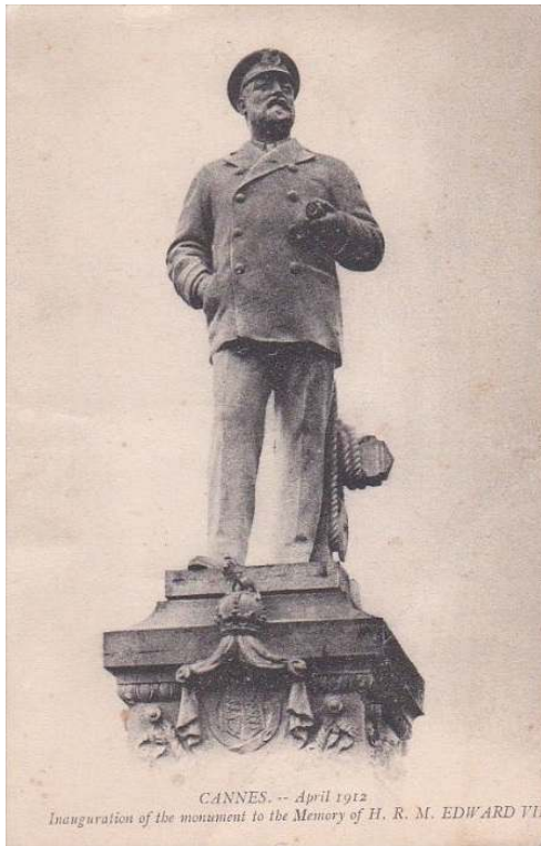
FRENCH POSTCARD WITH AN ENGLISH CAPTION PUBLISHED IN CANNES PRIVATE ARCHIVES