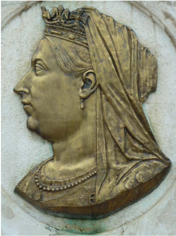
AUTHOR PHOTO, 2012.