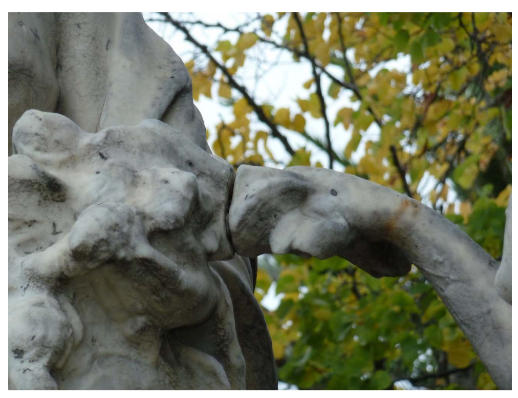
AUTHOR PHOTOS, 2012.

The Nice memorial was vandalized by German soldiers and the marks are still visible today. Only a few pieces of the statue were damaged and most of it remained intact, giving the impression that it was a spontaneous act committed by the soldiers of the Wehrmacht, not an official one ordered by high-ranking officers. It seems more probable that individual soldiers took to desecrating the statue without the heavy equipment needed to do so (the head and an arm were broken off among other features), though symbolically it is significant that the British monarch should be beheaded like her deposed forbear Charles I, as if Queen Victoria had been executed for "high treason". If so, the gesture is not without precedent, such as the symbolic beheading reported in La Croix Illustrée in its edition of 9 June 1907 which shows a rioting Indian crowd with the severed head and crown from a statue of Queen Victoria.<sup>3</sup>