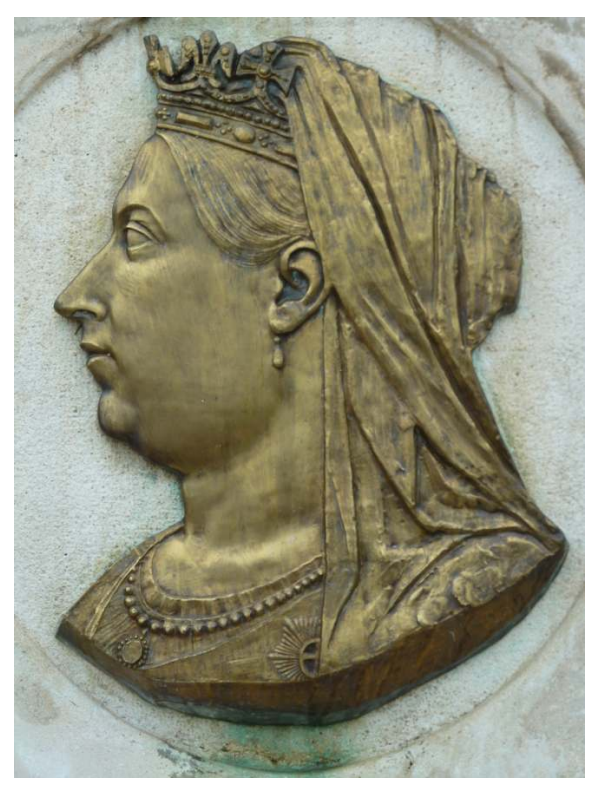
AUTHOR PHOTO, 2012.