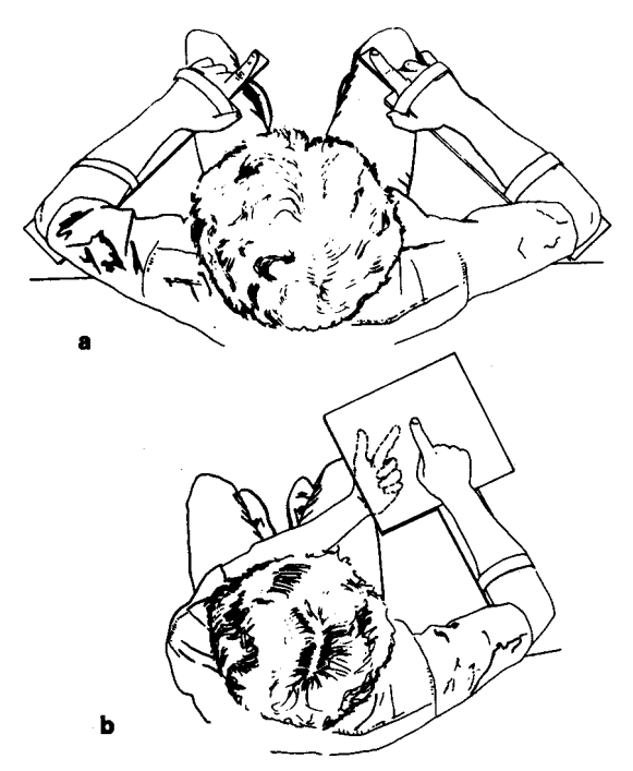
Fig. 1. Illustration of the experimental set-up: subject viewed from above in matching (a) and pointing (b) tasks.

0.25%) fixed beneath the rotation axes and stored on a computer after analog to digital conversion.