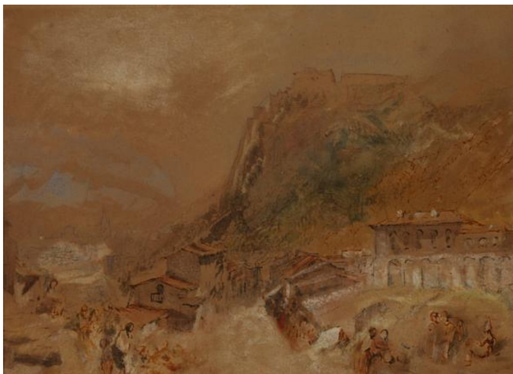
Fig. 3 The Bastille at Grenoble from the Village of La Tronche, 1835-1840? (W 1028), black chalk, pen and ink, watercolour and gouache on buff paper, 140 x 192 cm.