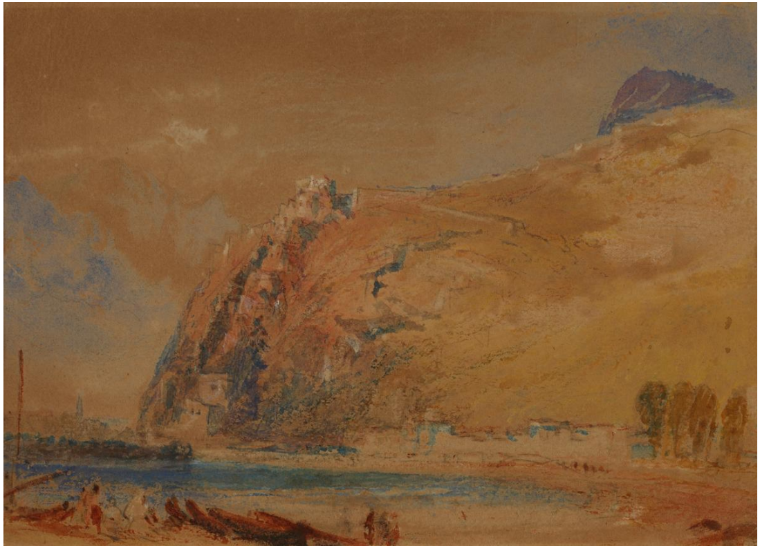
Fig. 1 The Bastille at Grenoble from the Valley of the Isère, 1835-1840? (W 1035), pencil, watercolour and gouache on buff paper, 138 x 192 cm.

For the first work, Turner positioned himself on the right bank of the river near what was at the time the village of St-Ferjeux (today integrated into the commune of La Tronche) (see fig. 3). The village of La Tronche lies before him on the same side of the river and the Bastille is at the top of the ridge of Mount Rachais, which forms one of the ends of the Grande Chartreuse Massif looming above the city of Grenoble. At its base on the river's edge, fortified works protect the portal of Savoy (Saint-Laurent portal). Between the two, a rampart runs down the line of steepest slope, whereas on the right another wall winds down from the fort toward the village of La Tronche. The small boats at the water's edge in the foreground, surrounded by people, show that in the valley of Grésivaudan the wide meanders of the Isère were navigable for this kind of watercraft.