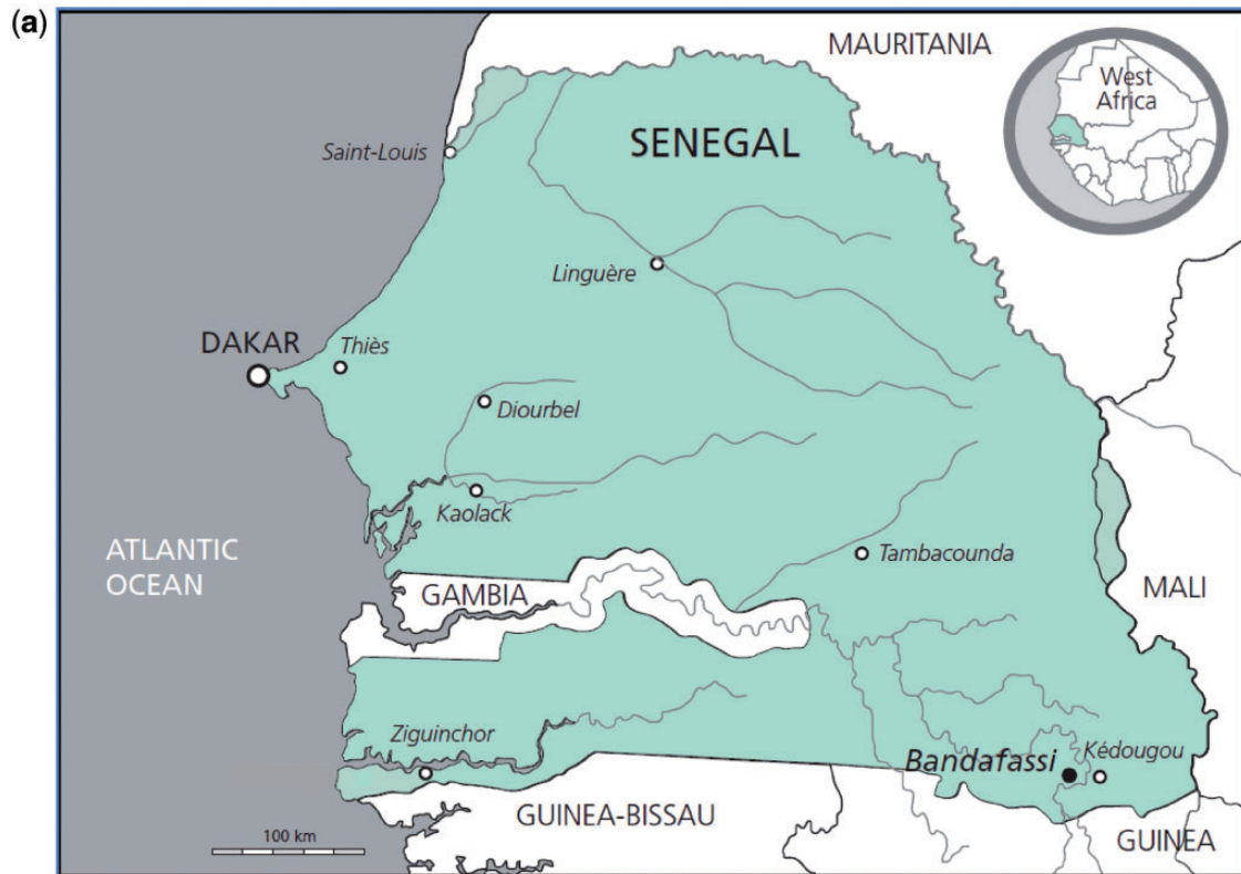
Figure 1a. Location of Bandafassi HDSS in Senegal.