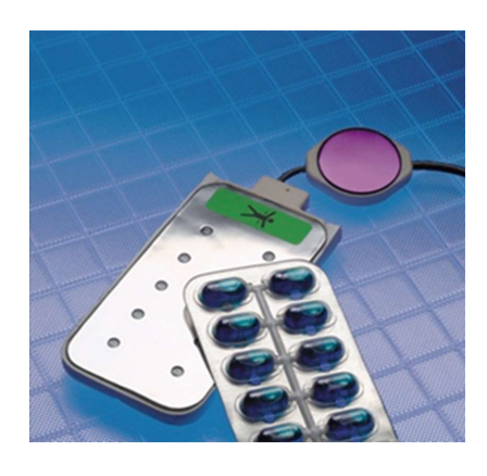
Figure 4 One defibrillator electrode with ten gel capsules inserted in, and one non-adhesive electrocardiogram electrode.

symptomatic NYHA III or IV ambulatory heart failure and LVEF < 0.30. Differently, the BIROAD study enrolled: (1) patients after a recent MI or coronary artery bypass grafting (CABG) and having complications such as VA, syncope or low LVEF < 0.30, but not receiving an ICD for up to 4 mo; and (2) patients who met criteria for an ICD but refused therapy or had to wait for at least 4 mo before implantation. A total of 289 patients were enrolled in both studies, united into one at the request of the Federal Drug Administration, and followed during a total of 901 mo of patient use. During the follow-up, 6 of 8 defibrillation attempts were successful. No patient died while correctly wearing the WCD.