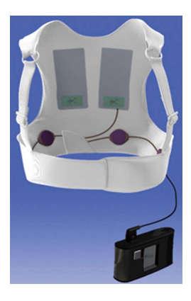
Figure 1 Wearable cardioverter defibrillator. The two defibrillator electrodes are worn on the back of the garment, when the four monitoring electrodes are placed on the elastic belt around the chest. Both systems are connected to the monitor unit.