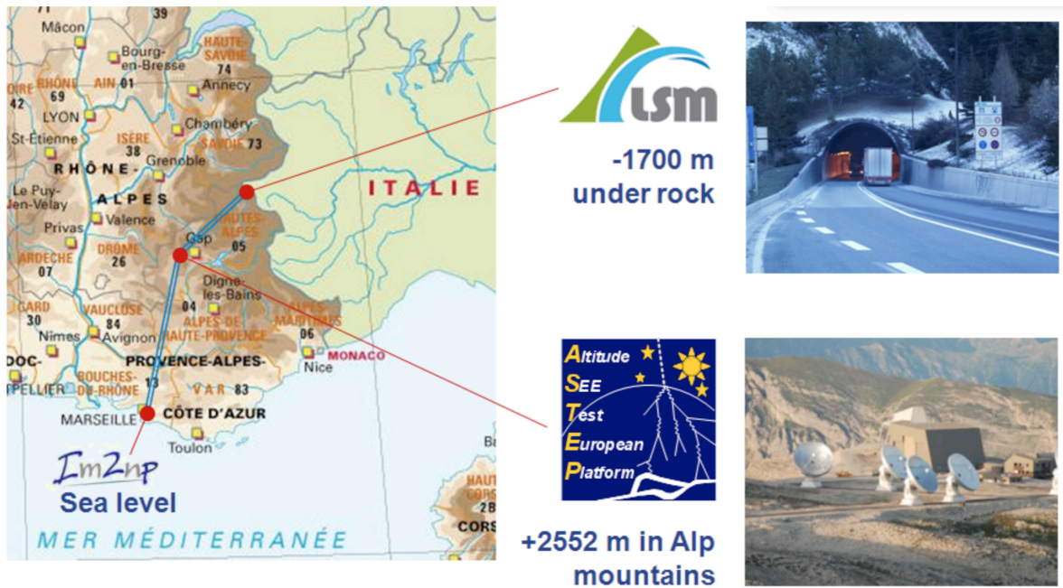
Figure 2. IM2NP/REER real-time test platforms.