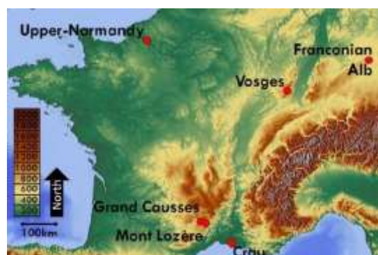
Figure 1. Map showing location of the six compared nutrient-poor grasslands in Western Europe (map under GNU-free documentation license).

includes single subsurface sampling (Vernet, 2006) only (Friedericaa, in respect to compilation by Goepf, 2007).