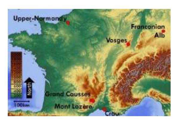
Figure 1. Map showing location of the six compared nutrient-poor grasslands in Western Europe (map under GNU-free documentation license).