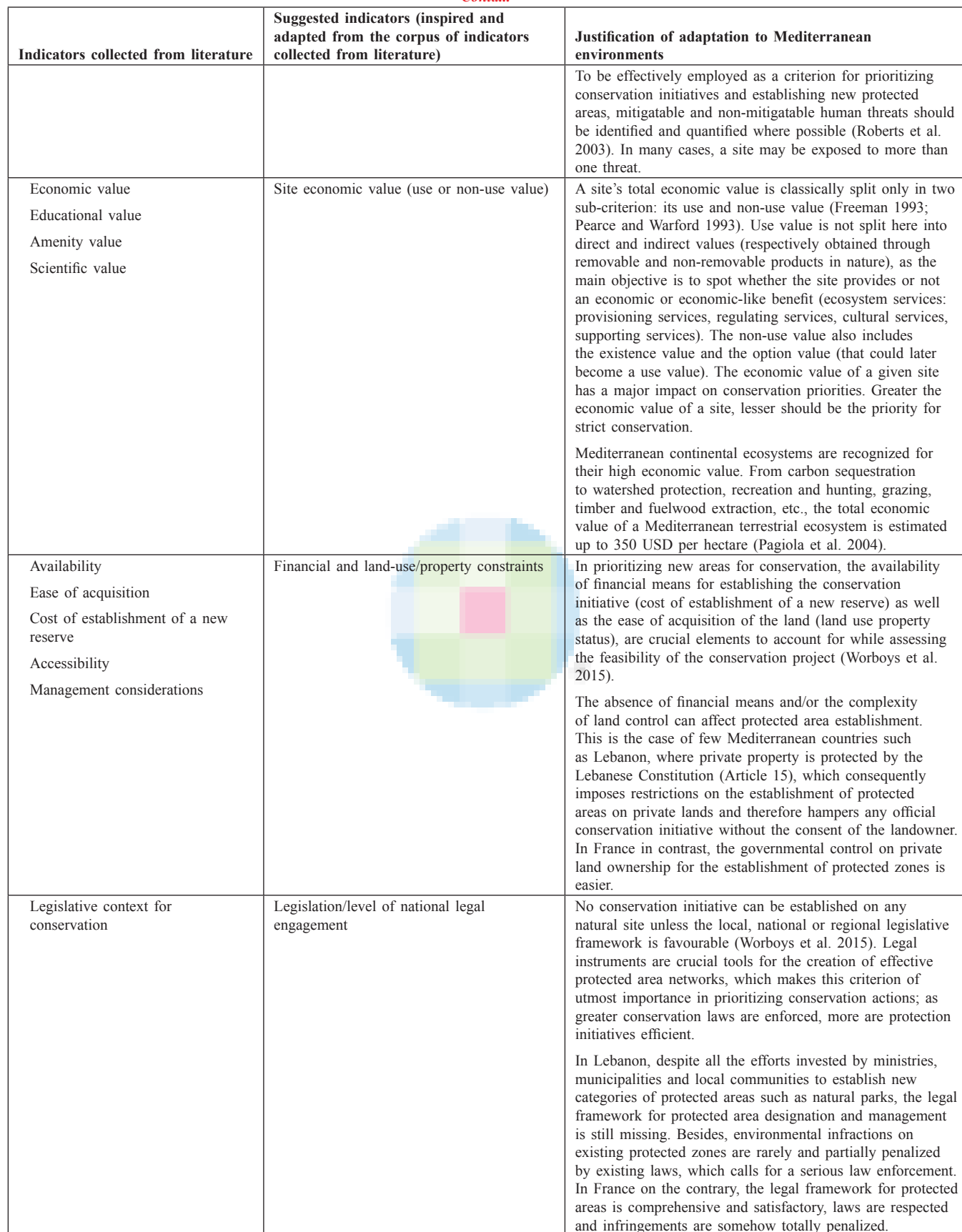
Table 1 Contd...