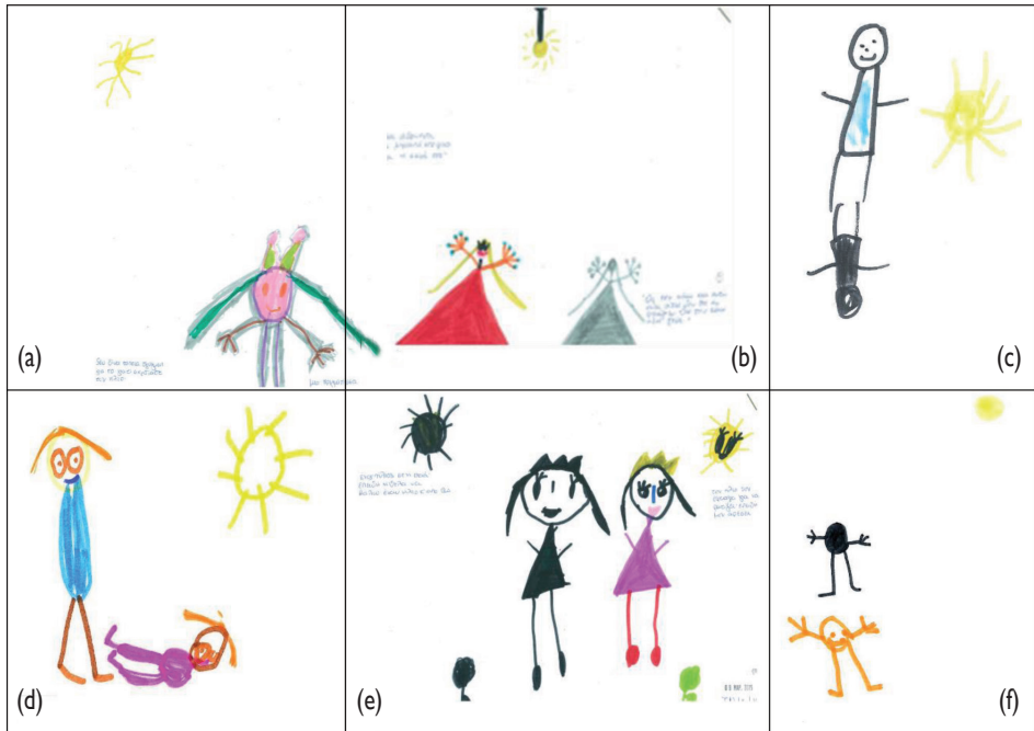
Position and arrangement of shadow with respect to the light source and the object: (a) shadow behind, (b) and (c) light source on top and middle, (d) and (f) shadow between the object and the light source, (e) shadow as a symmetrical reflection