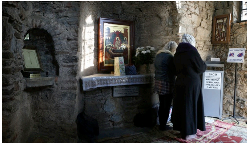
Two Muslim women praying in the House of Mary