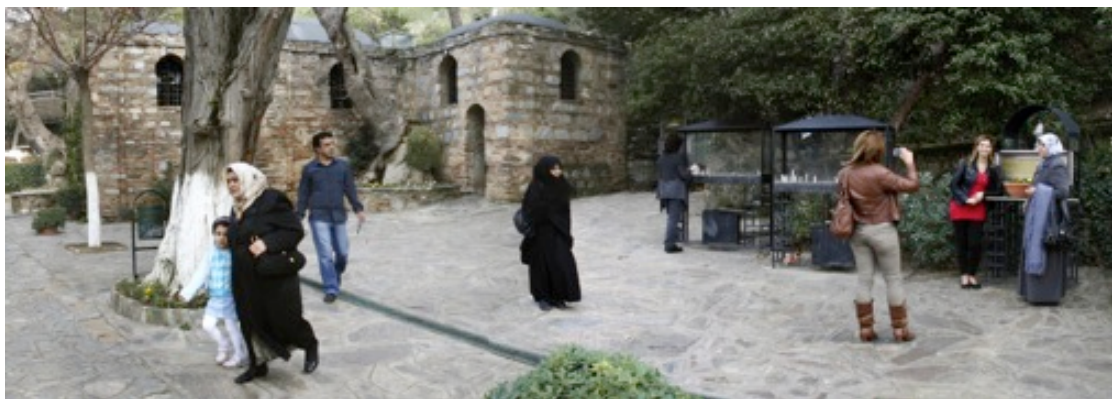
Muslim visitors on the esplanade of the House of Mary

The international dimension of the House of Mary has grown until today and has recently been reaffirmed by Pope Francis, during his official visit to Turkey in December 2014, when he claimed: “This land is important for every Christian [...] because of the presence, near Ephesus, of what a venerable tradition considers the house of Mary, the place where the Mother of Jesus lived for a few years, center of the devotion of many pilgrims, not only Christians but also Muslims, coming from all over the world.” Each year, hundreds of thousands of people visit the shrine with very different motivations and expectations. The heritagization that began in previous periods is fully carried and accentuate the visitors heterogeneity. In fact, people can be pilgrims and/or tourists, Christians or Muslims, believers or non believers. Meryem Ana Evi has become an important pilgrimage site but also an economic center of religious heritage in Turkey.