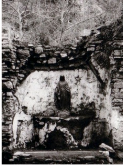
The sanctuary of Panaghia Kapulu in ruins, after its discovery in the late 19th century

Within a few years, the holy site became quite famous not only in Turkey, through religious press impacts. The entrepreneurs of the pilgrimage try to promote the case of Ephesus against the tradition of Jerusalem. Then, the House of Mary became firstly a regional center of pilgrimage. Not only for Catholics but also for Greeks, Armenians and Protestants, according to Father Poulin (1999:162). The pilgrimage grew until the First World War when the hill is devastated. During the Greco-Turkish War (1919-1922), that triggered the tragic population exchange between the two countries in 1923, Smyrna was occupied by the Greek Army then taken by the Turkish one after a tragic fire. The college of the French missionaries was destroyed and most of European communities left the country. This was the end of the cosmopolitanism of Smyrna (Georgelin 2005). In Ephesus, the Christian pilgrimage was over. The land of Panaghia Kapulu was even confiscated by the new Turkish administration, but French missionaries managed to get it back in court of cassation in 1932.