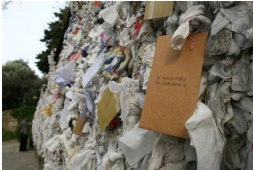
Wishing Wall, House of Mary

the concretion of the prayers of thousands of people. This wall is their visible concretion. This wall is the World!”