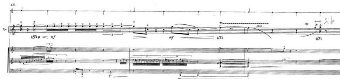
III. 1: extract from Metallica score, for solo trumpet and live electronics, Éditions Durand, p. 8.

This graphic representation gives clues to the composer's musical intentions and reference points for identifying natural acoustic and electroacoustic passages. It is a tool for establishing relations – however imperfectly – between the two sound spaces. Moreover, exploring the writing methods of an electroacoustic piece on the epistemological level is of significant interest. What determined the way musical elements were notated? Didactic questioning on playing modes, sound rendering and transmission of musical thought highlight the composer's motivations and choices.