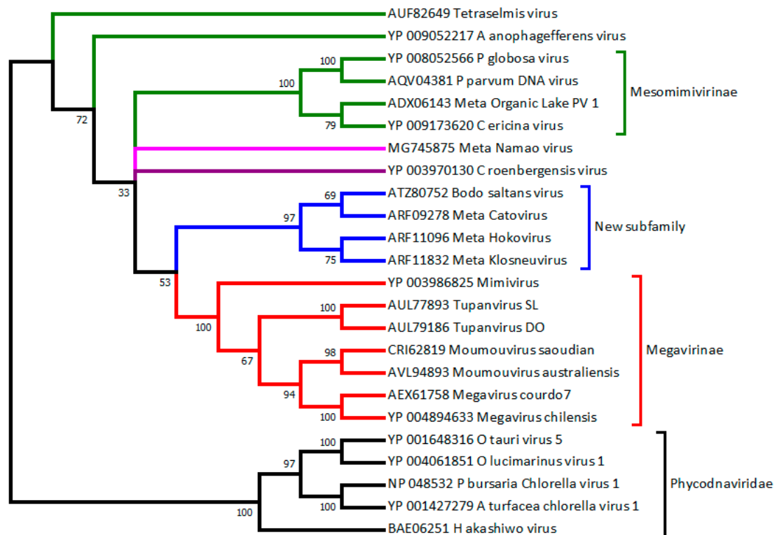
Figure 1. Phylogeny of Mimiviridae vs. Phycodnaviridae based on DNA polymerase B. Diverse algae-infecting “Phycodnaviruses” (prasinovirus OtV5, OIV1; raphidovirus HaV1; chlorovirus PbCV1, AtCV1) clearly cluster as an outgroup (with high confidence). The Mimiviridae members cluster in different proposed subfamilies (from the bottom up): The “ Megavirinae ” (in red, closest to Mimivirus), a new clade including BsV (in blue, mostly defined by Klosneuvirus-like metagenomics assemblies), the Mesomimivirinae (in green, with PgV and CeV). These proposed subfamilies are highly supported (bootstrap values > 97%). In contrast, CroV (in indigo), Namao virus (in purple), AaV, and TetV (in green) remain isolated. This tree was produced from an alignment of 24 sequences (519 sites) using neighbor joining and the JTT substitution model. Bootstrap values are indicated on each branch. These computations were performed on the MAFFT online service [50]. NCBI accession numbers are given for each sequence. The prefix “Meta” indicates sequences from nonisolated viruses. A more generic phylogenetic tree placing the Mimiviridae in the context of other large DNA virus families is shown in [51].