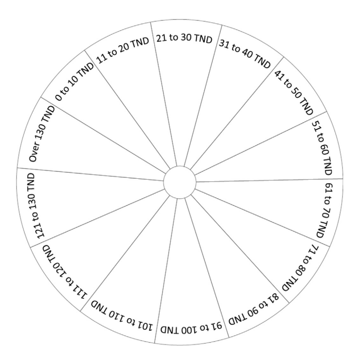
Fig. 2. Circular payment card used in the Social Ins. Survey (English translation).

Chanel et al. (2017) establish the advantages of the CPC over the standard PC on a single elicitation question: it helps eliminate starting-bid bias (because each section is equally likely to be seen at first glance) and middle-card bias (by construction), and strongly reduces the range effect associated with the bids chosen (the succession of bid ranges mimics a continuous distribution). Since the respondent has to spin the circular card to reach the section corresponding to his/her WTP, both cognitive and (a small) physical effort