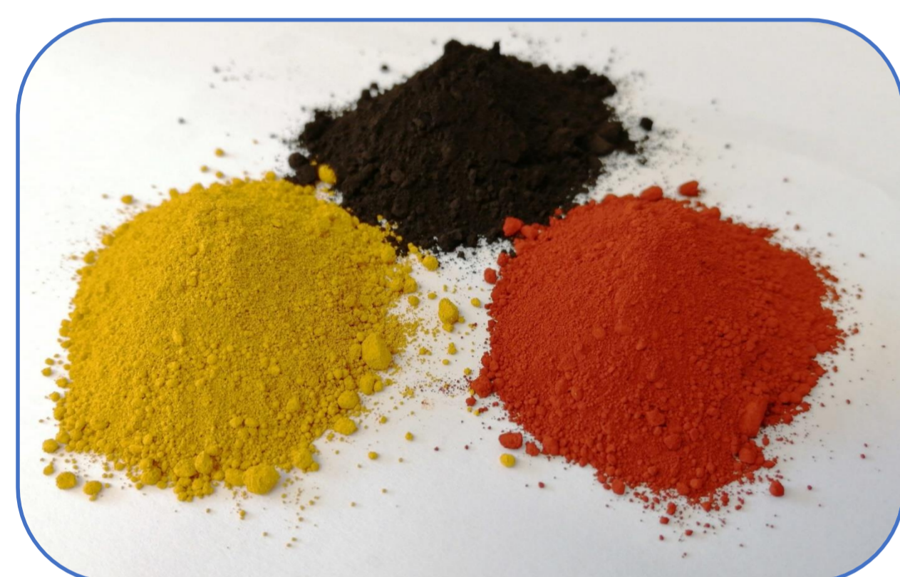
Figure 1: Fe(III)-oxides powders (Goethite, Ferrihydrite, Hematite)

Today, chlordecone (CLD) , an organochlorine pesticide spread on the soil to control the populations of the banana weevil, is responsible for an unprecedented health, environmental, social and political crisis in the French West Indies (FWI) . Despite the health management measures implemented by the authorities to prevent CLD from reaching the consumer's plate, the population continues to be exposed . A definitive solution to the problem would be to destroy the CLD stock in the soil .