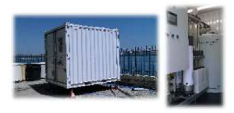
Figure 1. UF pilot plant [2 industrial modules 84m2, MWCO = 100kDa]

Material and Methods: The study was conducted during 18 months. The first part, using seawater, was conducted at the Marine Station of Sète (Thau Lagoon, Experimental Marine Ecology Center MEDIMEER UMS 3301, University of Montpellier-2, France) and the second part, using fresh water, was conducted at the Wageningen Marine Research Ballast Water Test Facility, Den Helder (the Netherlands). Constant flux in dead-end ultrafiltration experiments were performed in a mobile unit containing an automatic pilot plant at semi-industrial scale (Figure 1).