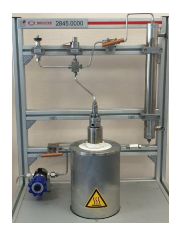
Figure 1. Experimental apparatus

The aims of this work is to experimentally treat asbestos containing waste. First, an experimental assessment method is developed to qualify the performance of hydrothermal process. Then, a parametrical study is realized to determine influence of temperature, pressure, treatment duration, concentration and variety of asbestos (Table 2).