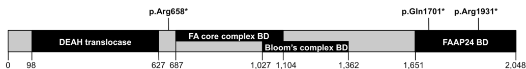
Fig. 2 Schematic diagram of the 2,048 amino acid long FANCM protein. The functional or binding domains (BD) are indicated in black and as reported in Deans and West, 2009. The position of the three FANCM truncating variants c.1972C > T (p.Arg658*), c.5101 C > T (p.Gln1701*) and c.5791 C > T (p.Arg1931*) is also shown

proband carrying homozygous FANCM truncating variants were recently described. 9 Three of these, two homozygous for p.Gln1701*, and one for p.Arg1931*, developed breast cancer at age 52 years or later and their cells did not demonstrate chromosome fragility. The other two probands were homozygous for p.Arg658* and developed early-onset breast cancer (at age 29 and 32); in addition, one developed several cancers, and the other demonstrated chromosomal fragility. 9