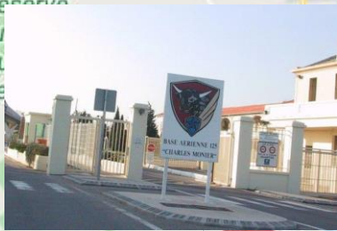
Military Air Force Base