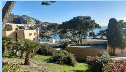
Carry le Rouet quarantine base