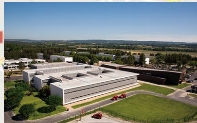
Aix en Provence quarantine base