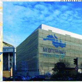
IHU Méditerranée laboratory