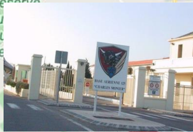
Military Air Force Base