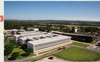
Aix en Provence quarantine base