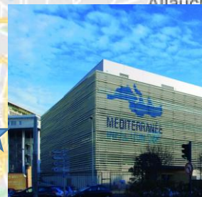
IHU Méditerranée laboratory