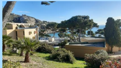
Carry le Rouet quarantine base