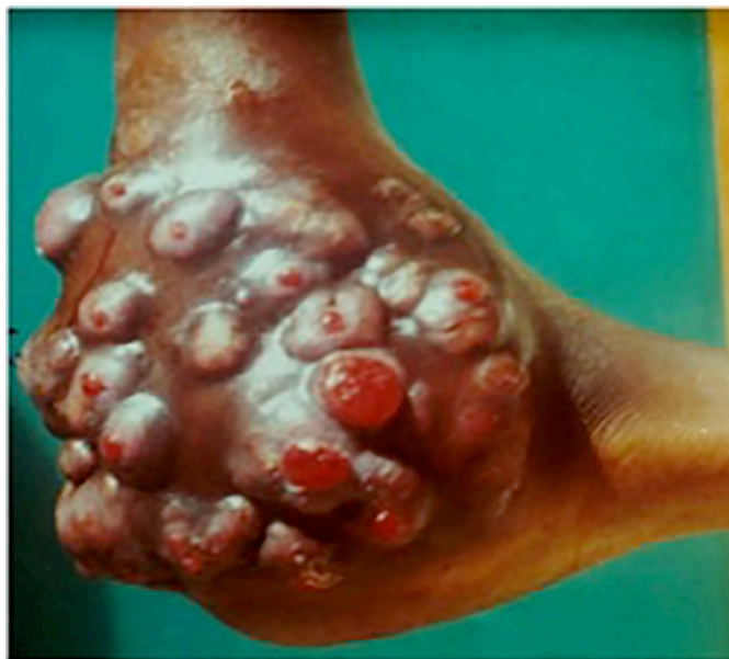
Fig 3. “Madura foot” caused by Actinomadura pelletieri .

https://doi.org/10.1371/journal.pone.0231871.g002