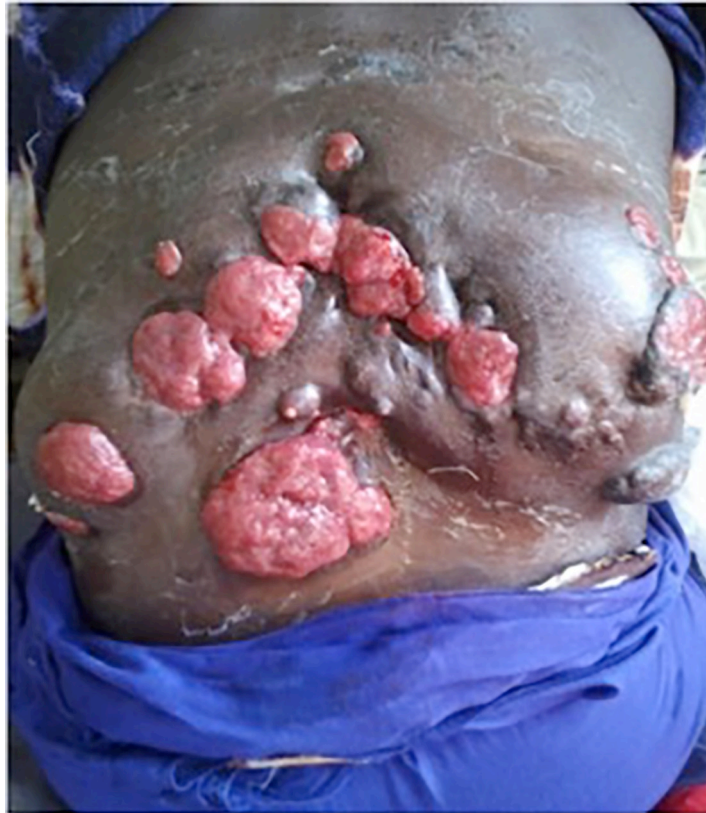
Fig 2. A dorsolumbar tumoral actinomycetoma cases due to Actinomadura pelletieri .

https://doi.org/10.1371/journal.pone.0231871.g002