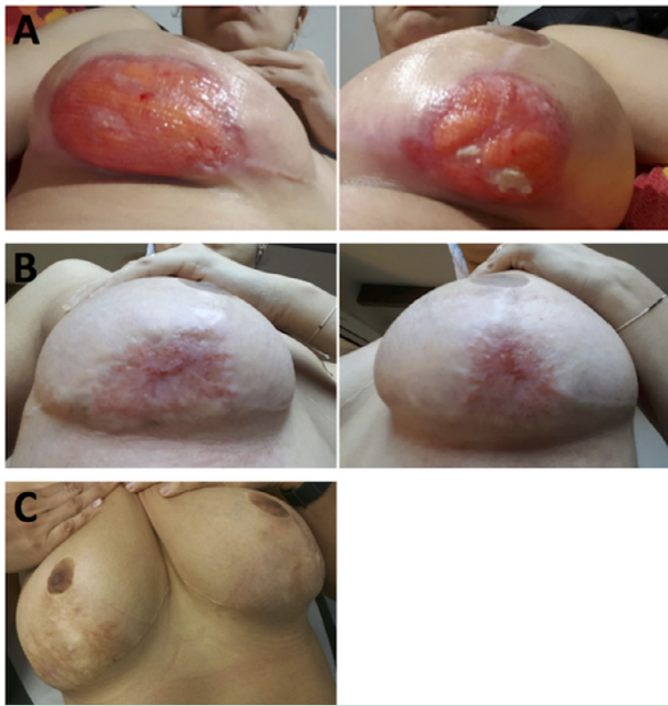
Figure 3 With treatment, the patient's bilateral ulcerative mammary lesions resolved over time. The lesions at 2 months (A). The lesions at 5 months (B). One year after induction therapy, the patient had a complete recovery (C).

Thus, pyoderma gangrenosum could be a cutaneous manifestation of granulomatosis with polyangiitis in some patients. Malignant pyoderma, a different disorder that looks like pyoderma gangrenosum, has been documented infrequently in this group. Unlike pyoderma gangrenosum, it occurs mainly on the face. Severe inflammation is compounded by extreme damage to ulcerated areas, and often, systemic symptoms. To differentiate between malignant pyoderma and pyoderma gangrenosum, physicians should pay attention to extracutaneous symptoms. Additionally, the histologic findings are atypical for pyoderma gangrenosum, and the lesions can progress, despite treatment. The possibility exists that patients who present with pyoderma gangrenosum—or malignant pyoderma, as in our patient's case—have an underlying granulomatosis with polyangiitis, so ANCA testing and histopathology should be considered.