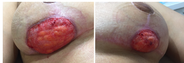
Figure 1 On presentation, the patient had bilateral ulcerative mammary lesions.

Laboratory tests revealed elevations in the plasma fibrinogen level (5.4 g/L) and the C-reactive protein levels