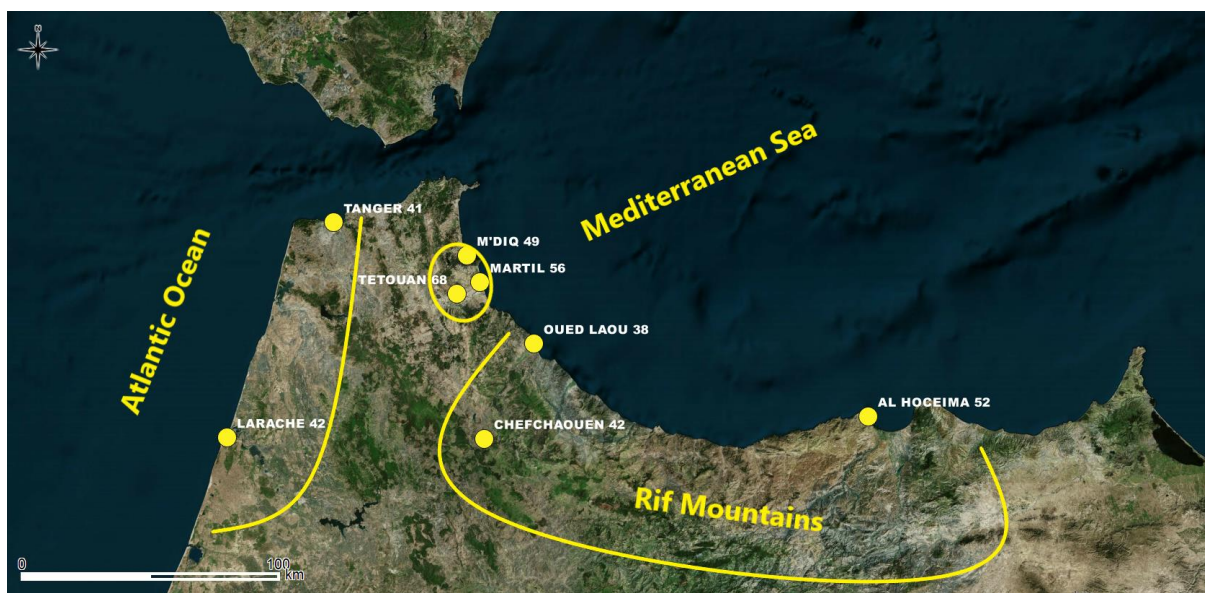
Figure 2: North Morocco with three main sub zones of the Atlantic coast (Tangier /41/ and Larache /42/), Mediterranean-Martil (Tetouan /68/, Martil /56/, M'Diq /49/) and Rif (Al Hoceima /52/, Chefchaouen /42/, Oued Laou /38/). Numbers in brackets indicate the number of questionnaires conducted per municipality.

Three-hundred-and-ninety-one inhabitants of the region North Morocco from eight different municipalities responded to the questionnaire in a public setting (Figure 2). The chosen municipalities belong to three areas of study (Figure 2) with different geographical, cultural and social characteristics, and with a different historical hazards record.