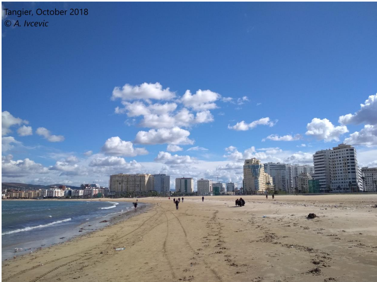
Figure 1a: The harbour development of Tangier, with hotels, restaurants and the marina.

residents (2014 census), whose coastal infrastructure is undergoing a significant economic (harbour) and tourism (marina, beach, hotels, resorts) development [25] (Figure 1a). One example of the Moroccan economic growth is the project of Tanger-Med port, which brought not only construction work and increased employment, but also anarchic settlements and brand-new environmental issues arising from the rubble freshly excavated from the port, as well as landslides and water issues [6].