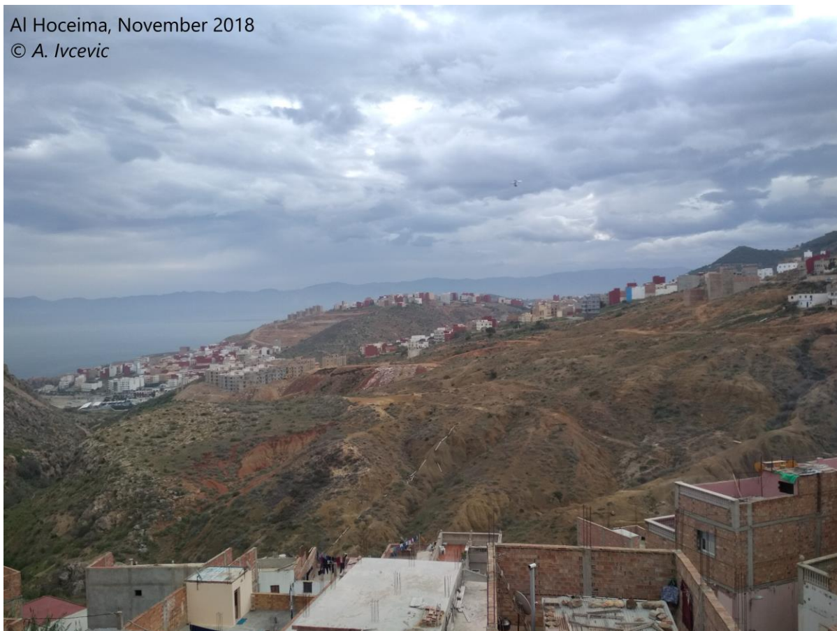
Figure 1c: The construction sites in Al Hoceima, exposed to landslides, flash floods and seismic risk.