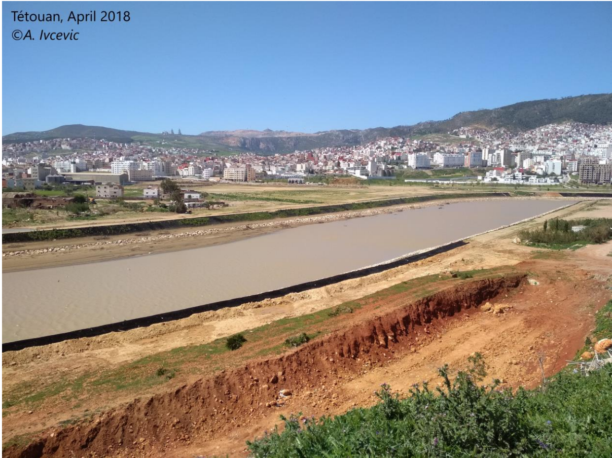
Figure 1b: Construction site of wadi of Martil floodplain in Tetouan.

The Rif Mountains are also very vulnerable to natural hazards. Due to natural predispositions of hills, a barely consolidated flysch lithology is prone to landslides [9, 10]. Moreover, many forest surfaces of the region were converted to agricultural parcels, leading to amplified soil erosion [6]. Since it is located at the transition between a Mediterranean climate with oceanic influence to the North, and a more arid climate to the South, the interior of Morocco is also prone to drought, floods and flash floods, where periods of rain and drought alternate [7]. These are not the only worrying hazards, as the region is also located in a seismically active zone [8]. It experienced three earthquakes in a period of 22 years, with the 2004 notorious disaster of Al Hoceima earthquake (magnitude 6.4). Together with the adjacent Gulf of Cadiz and the Alboran Sea, this region hosts most of the Moroccan seismicity and belongs to the diffuse plate boundary between the Nubian and Eurasian plate [8]. Indeed, the relatively superficial nature of the seismicity combined with weak ground mechanical properties led to significant damages on constructions that do not always respect building standards [49] (Figure 1c).