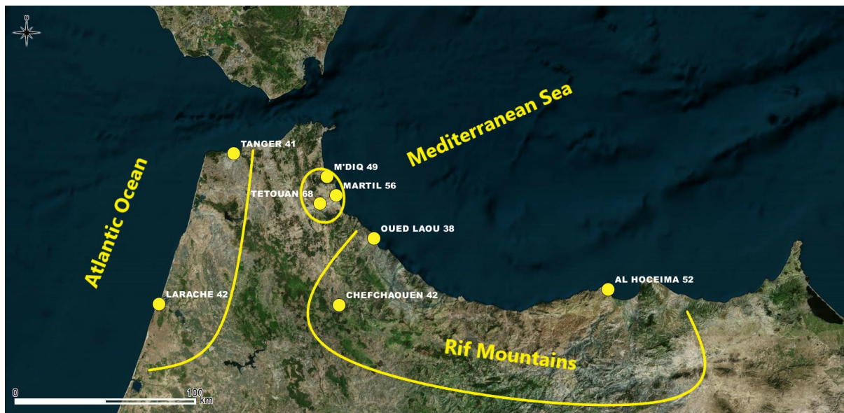
Figure 2: North Morocco with three main sub zones of the Atlantic coast (Tangier /41/ and Larache /42/), Mediterranean-Martil (Tetouan /68/, Martil /56/, M'Diq /49/) and Rif (Al Hoceima /52/, Chefchaouen /42/, Oued Laou /38/). Numbers in brackets indicate the number of questionnaires conducted per municipality.

Three-hundred-and-ninety-one inhabitants of the region North Morocco from eight different municipalities responded to the questionnaire in a public setting (Figure 2). The chosen municipalities belong to three areas of study (Figure 2) with different geographical, cultural and social characteristics, and with a different historical hazards record.