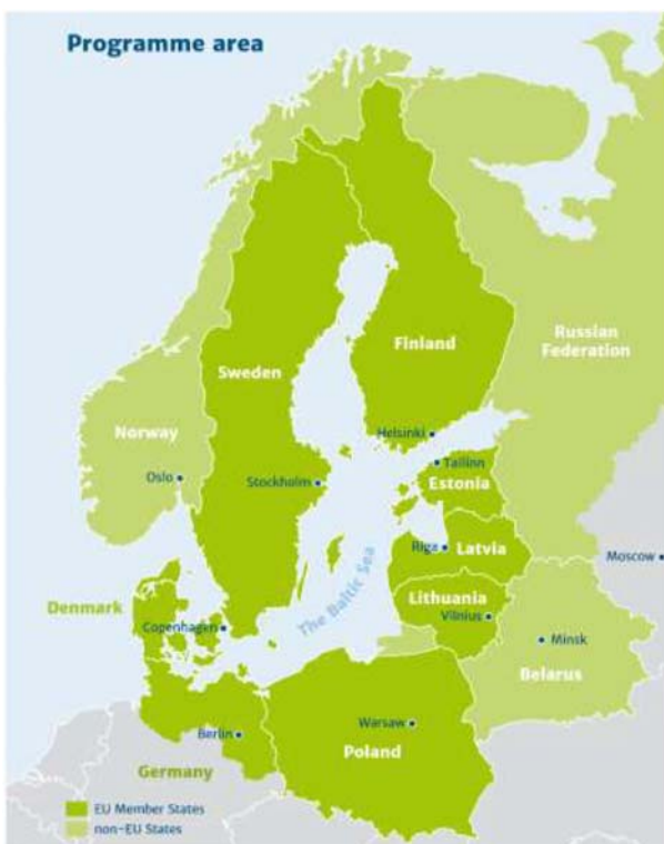
FIGURE 1 Baltic Sea Region CBC programme area, 2014–20.

The South-East Finland–Russia CBC programme involves three Finnish regions (Etelä-Karjala [South Karelia], Etelä Savo [South Savo] and Kymenlaakso) and two Russian regions (Leningrad and St Petersburg) as a core area. Its adjoining region includes Uusimaa, Päijät-Häme, Pohjois-Savo, North Karelia (Finland) and Republic of Karelia (Russia) (see Figure 2). The programme's overall objective were achieved through improved competitiveness, increased economic activity, a knowledge-based economy, skilled labour force, high-level cultural events and