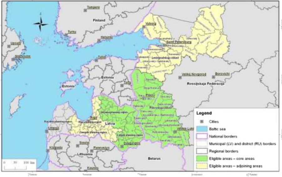
FIGURE 4 Latvia–Russia CBC programme area, 2014–2020.

The programme's thematic objectives include: (i) the promotion of local culture and preservation of historical heritage; (ii) promotion of social inclusion and the fight against poverty; (iii) support for local and regional good governance; and (iv) promotion of border management and border security, mobility and migration management