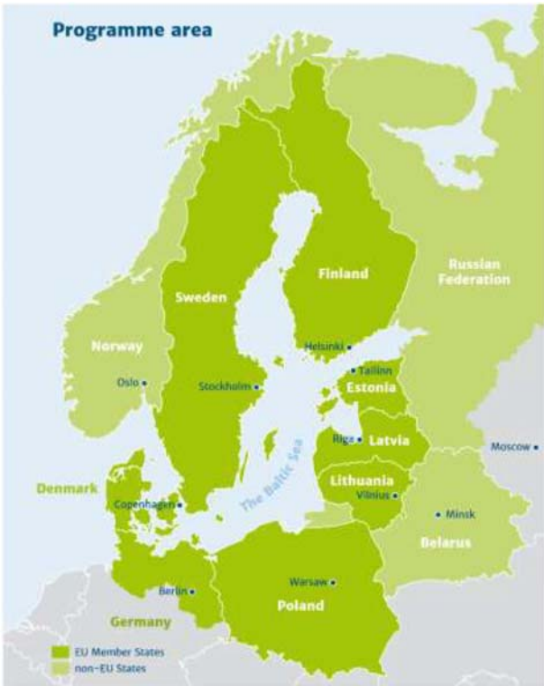
FIGURE 1 Baltic Sea Region CBC programme area, 2014–20.

The South-East Finland–Russia CBC programme involves three Finnish regions (Etelä-Karjala [South Karelia], Etelä Savo [South Savo] and Kymenlaakso) and two Russian regions (Leningrad and St Petersburg) as a core area. Its adjoining region includes Uusimaa, Päijät-Häme, Pohjois-Savo, North Karelia (Finland) and Republic of Karelia (Russia) (see Figure 2). The programme's overall objective were achieved through improved competitiveness, increased economic activity, a knowledge-based economy, skilled labour force, high-level cultural events and