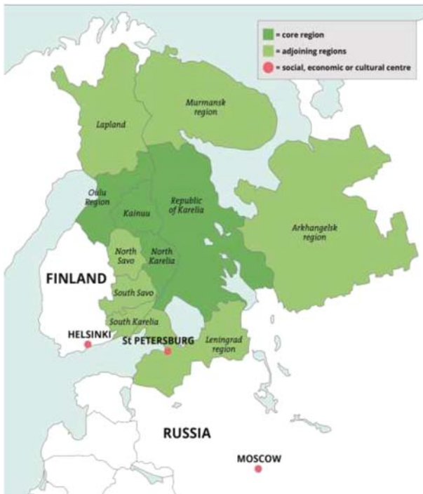
FIGURE 8 Karelia CBC Programme 2014–2020 area.