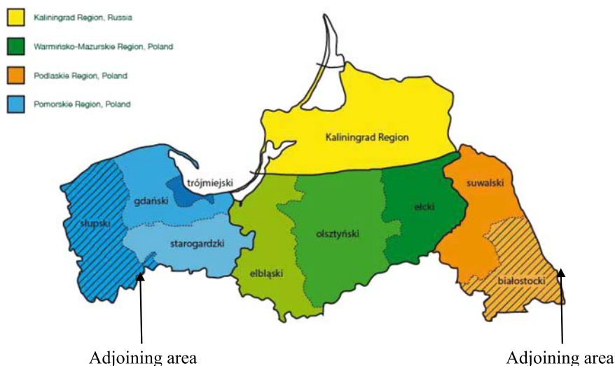
FIGURE 6 Poland–Russia CBC programme area, 2014–2020.