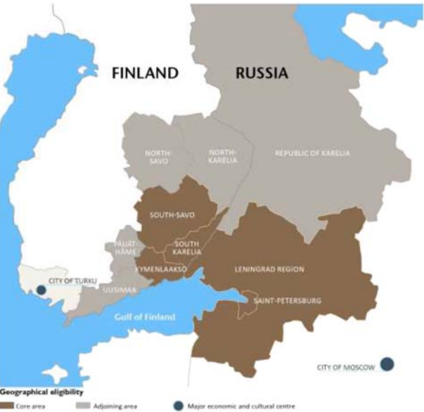
FIGURE 2 South-East Finland–Russia CBC programme area, 2014–20.

tourism, pure nature and waters, easy mobility, good transport corridors, and smooth and modern border crossing points (South-East Finland–Russia CBC 2014–2020, 2018). Before the coronavirus pandemics cross-border transport system between South-East Finland, Leningrad Region and Karelia was the best one in northeastern Europe and bottle-neck were almost eliminated on the cross-border highways.