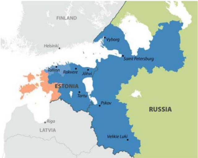
FIGURE 3 Estonia–Russia CBC programme area.

The Estonia–Russia programme includes three Estonian (Kilde-Eesti, Lõuna-Eesti, Kesk-Eesti) and three Russian (Leningrad, Pskov and St Petersburg) regions as a core area. Põhja-Eesti (Estonia) belongs to the adjoining area (see Figure 3).