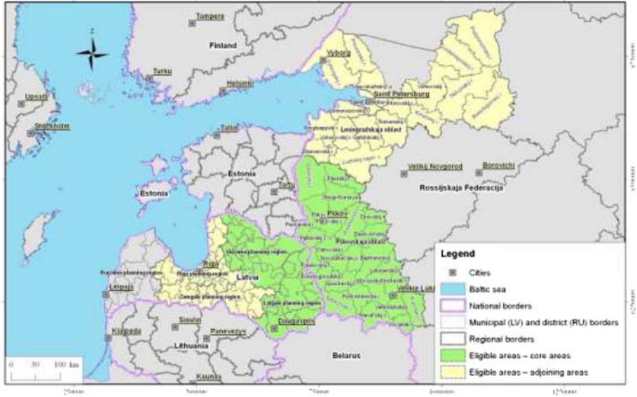
FIGURE 4 Latvia–Russia CBC programme area, 2014–2020.

The programme's thematic objectives include: (i) the promotion of local culture and preservation of historical heritage; (ii) promotion of social inclusion and the fight against poverty; (iii) support for local and regional good governance; and (iv) promotion of border management and border security, mobility and migration management